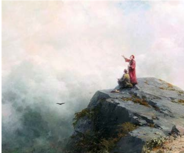
(Artist: Ivan Aivazovsky Date: 1817-1900)

Free me from this world of darkness and resentment! O remover of fear!