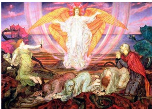
(Artist: Evelyn De Morgan Date: 1855-1919)

Let the darkness stops its attempt to control my heart! O protector of wars!