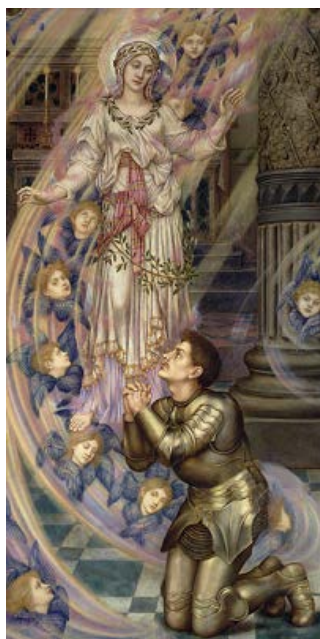
(Artist: Evelyn De Morgan Date: 1855-1919)

With Your Cosmic Light My Soul You Can Repair! O Mother of the Lightning!