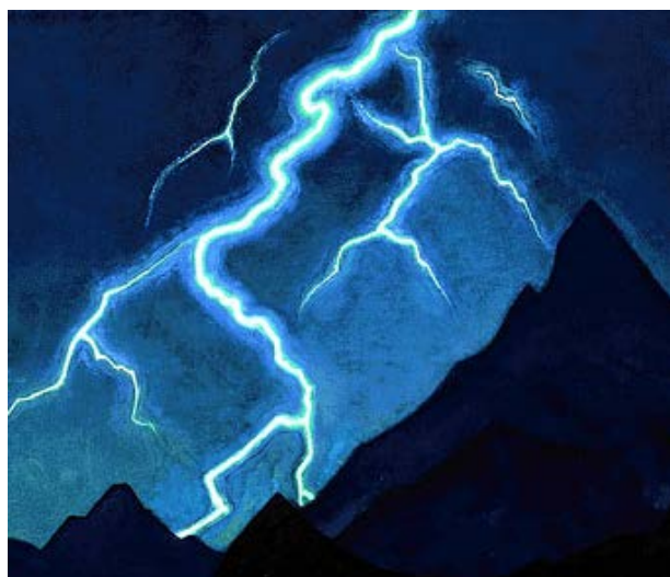
(Artist: Nicholas Roerich Date: 1942)

Let the Darkness Stop Its Attempt To Control My Heart! O Protector of Wars!