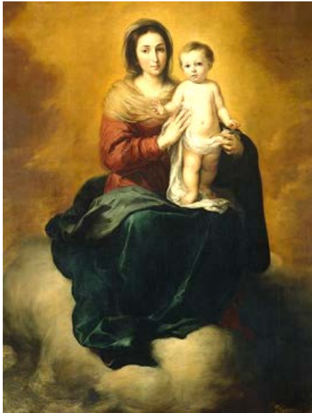
(Artist: Bartolome Esteban Murillo Date: 1617-1682)

Free me from this world of darkness and resentment! O remover of fear!